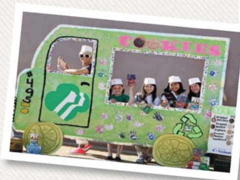
Girl Scouts of Southern Nevada, Troop #495

For your chance to win big visit girlscouts.org/cookie troop100 or contact your local council for more information.